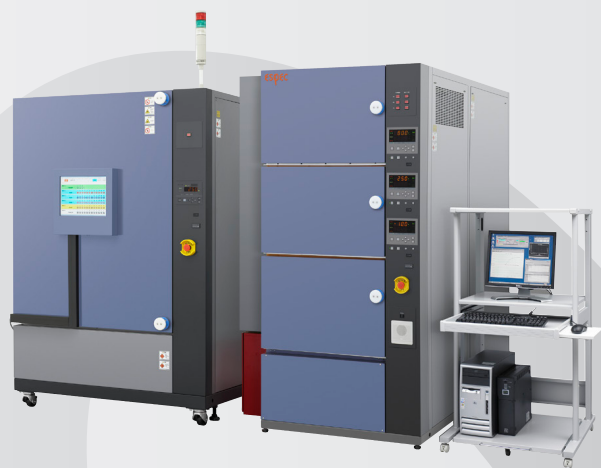
Advanced Battery Tester

Multiple functions including performance testing, durability testing, temperature characteristic testing and impedance evaluation (option) are included in this compact tester. A single tester can flexibly meet a wide variety of testing needs.