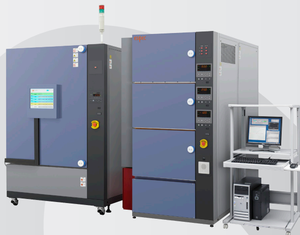
Advanced Battery Tester

Multiple functions including performance testing, durability testing, temperature characteristic testing and impedance evaluation (option) are included in this compact tester. A single tester can flexibly meet a wide variety of testing needs.